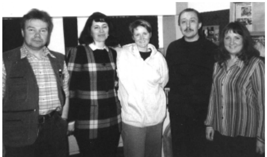
Journalists and Manager of New Life Radio with staff of the group using the SEAN TEE materials in Russia