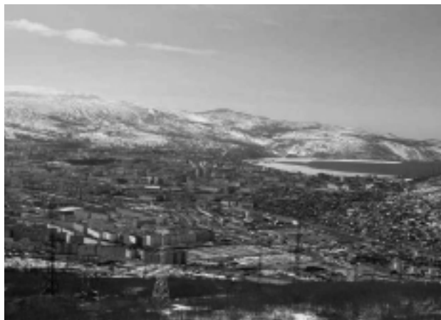
View across the city of Magadan

that already lessons learnt in Axminster are being applied: