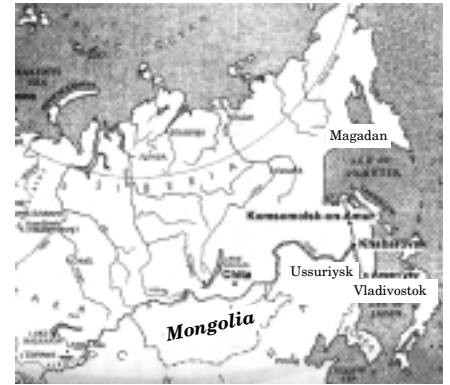
Showing Magadan and Vladivostok